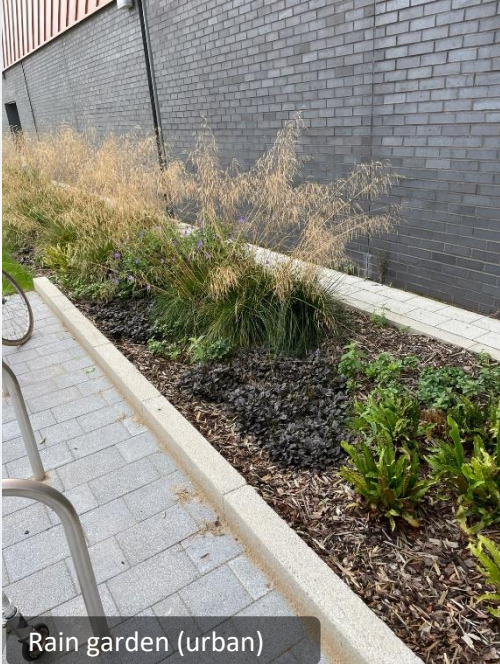
Rain garden (urban)