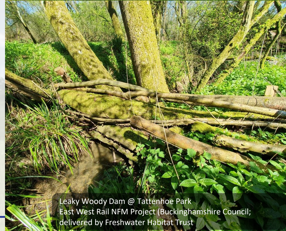
Leaky Woody Dam @ Tattenhoe Park East West Rail NFM Project (Buckinghamshire Council; delivered by Freshwater Habitat Trust)