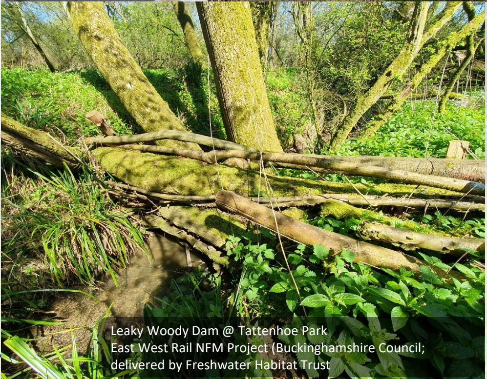
Leaky Woody Dam @ Tattenhoe Park East West Rail NFM Project (Buckinghamshire Council; delivered by Freshwater Habitat Trust)