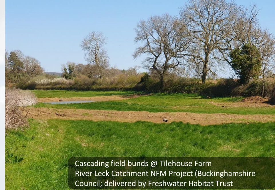
Cascading field bunds @ Tilehouse Farm River Leck Catchment NFM Project (Buckinghamshire Council; delivered by Freshwater Habitat Trust)

‘NFM involves implementing measures to restore or mimic natural functions of rivers, floodplains and the wider catchment , to store water in the landscape and slow the rate at which water runs off the landscape into rivers.’ (Cumbria Strategic Flood Partnership & Catchment Based Approach Partnerships, 2017) The measures should ‘complement other flood risk management approaches and involves working across the landscape to protect, restore or mimic the natural hydrological processes that occur.’ (CIRIA, 2022)